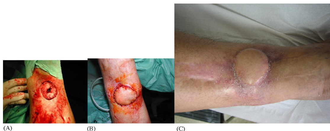
Figure 3 (A–C) Distal tibial osteomyelitis and fasciomusculocutaneous graft. Final result.

occurred in the area of the flap tunnelling that resolved satisfactorily without affecting the progress of the graft and with no significant consequences. Infection was not observed in any of the cases and slight venous congestion “of the flap” occurred in two patients. The donor area did not require further surgery in any of the patients in this series. The average surgery time was 70 min (50–90). The average size of the flap taken was 5 cm × 5 cm.