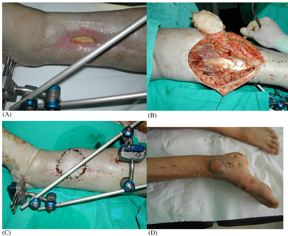
Figure 1 (A–D) Distal tibial fracture with external fixation. Final result.

We present a retrospective review of the sural fasciocutaneous flaps (SFF) carried out in the four centres of work of the authors of this article by the Department of Trauma and Orthopaedics Surgery between 2000 and 2005. The series comprised 14 patients, 12 men and 2 women with an average age of 38 years (23–54) and with a medium follow-up of 2 years (12–48 months). The most frequent cause leading to a soft tissue defect in the lower limb in our series was a distal tibial fracture (eight cases) (Fig. 1A–D) followed by sequelae from Achilles tendon reconstruction (two cases) and a fracture of the calcaneus (two cases) (Fig. 2A–D) (Table 1). In the remaining patients (two cases) the aetiology was osteomyelitis of the distal third of the leg with a soft tissue defect of the perimalleolar area (Fig. 3A–C). One patient was diabetic and there were four smokers. All flaps but one (case 6) were suprafascial. In all