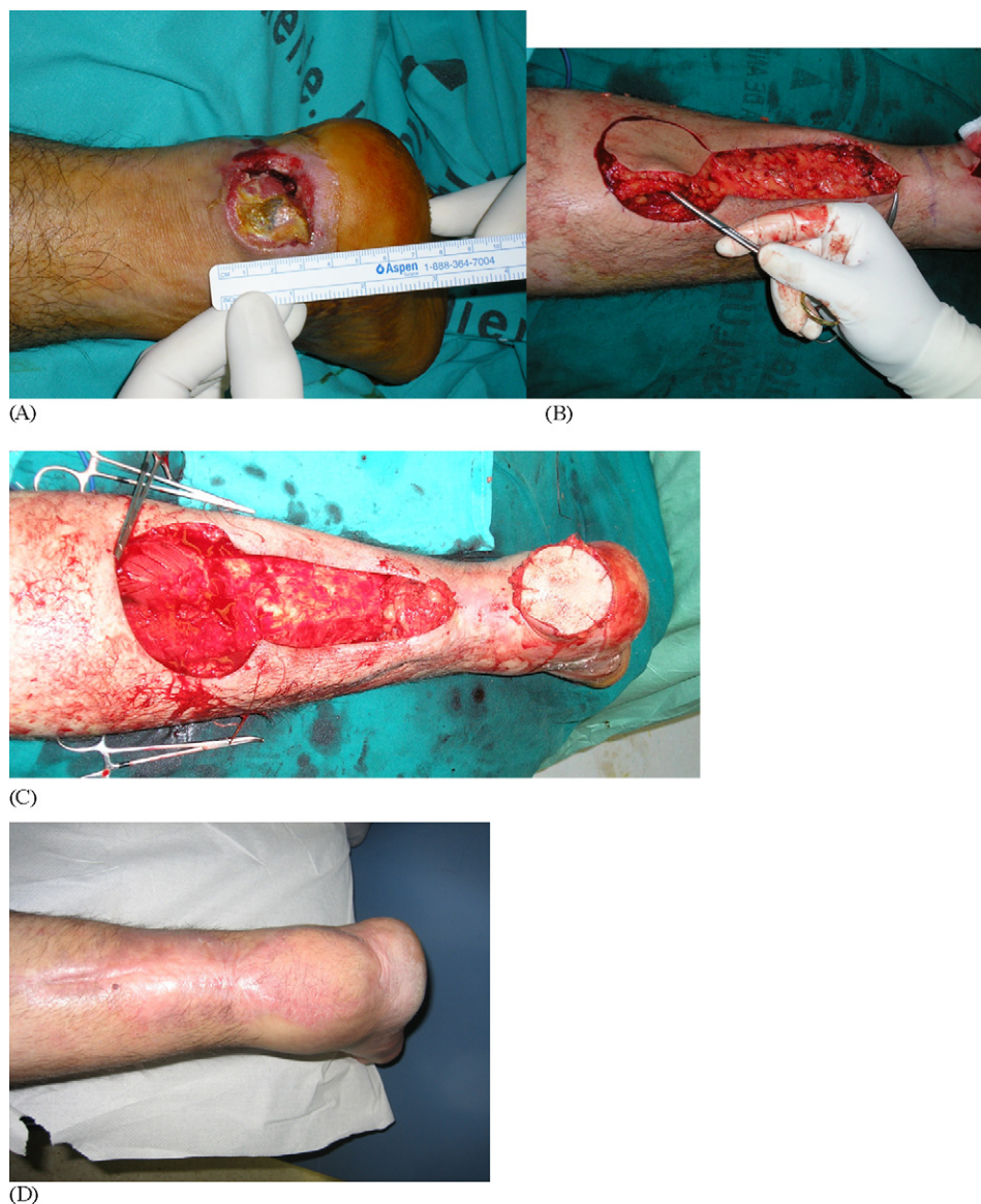
Figure 2 (A–D) Case 4. A calcaneus fracture and skin necrosis. Final result.

patients we used spinal anaesthesia and they were positioned prone. A tourniquet was placed in the proximal lower limb and exanguination achieved by elevation of the lower extremity; this facilitates the identification and dissection of the neurovascular structures in contrast with the use of the Esmarch bandage.